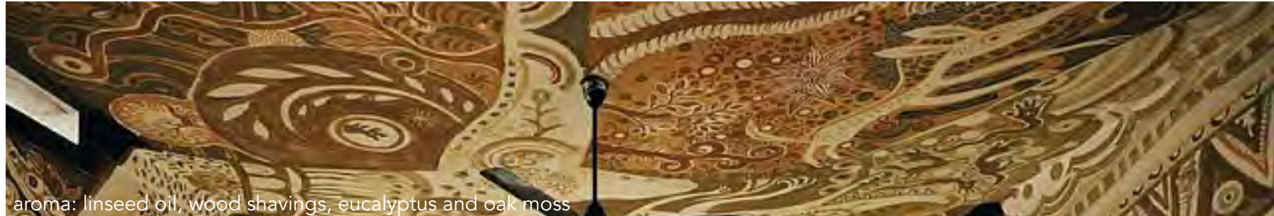
aroma: linseed oil, wood shavings, eucalyptus and oak moss