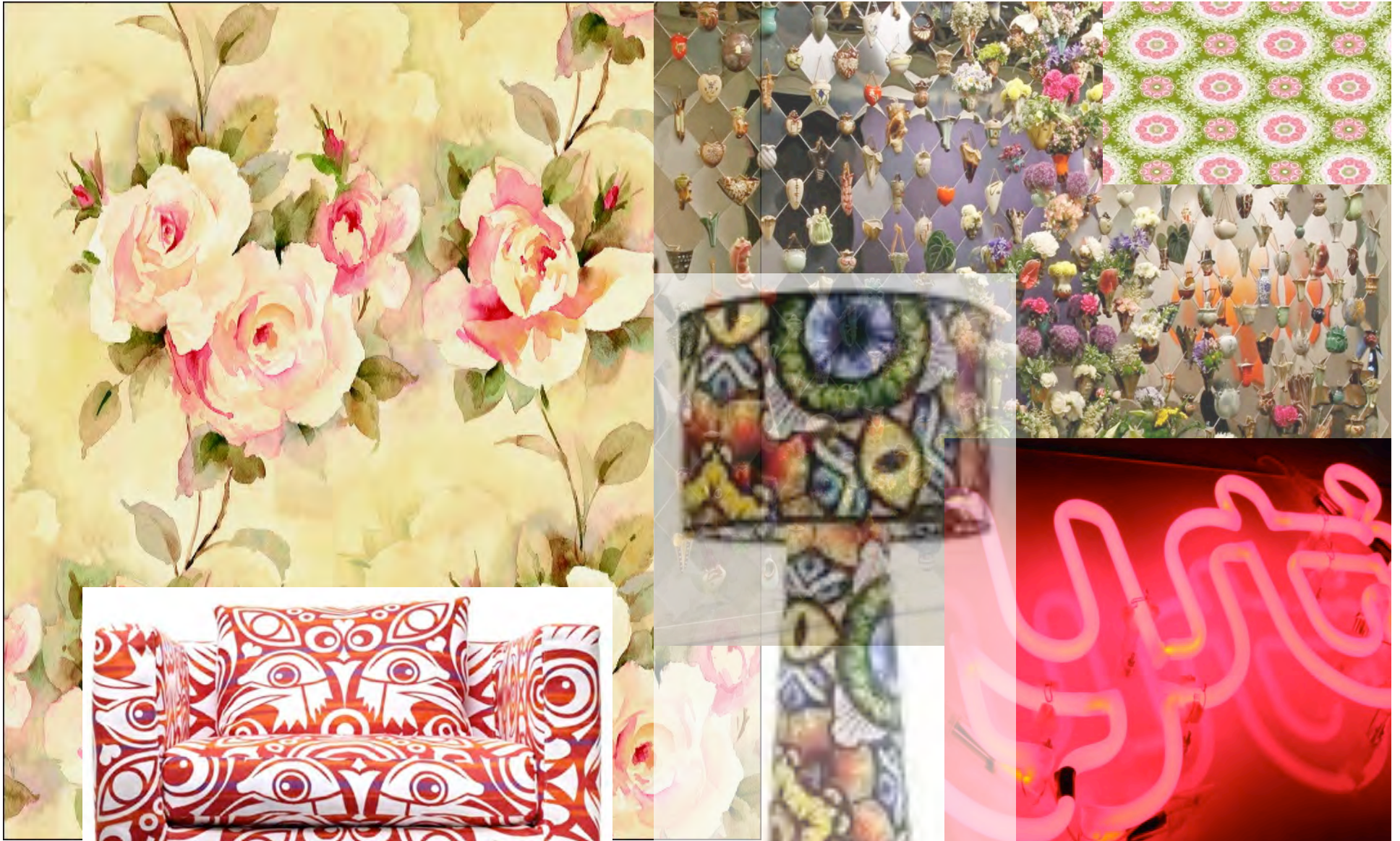
aroma: tuberose, dewy grass, jasmin, geranium and rosemary.