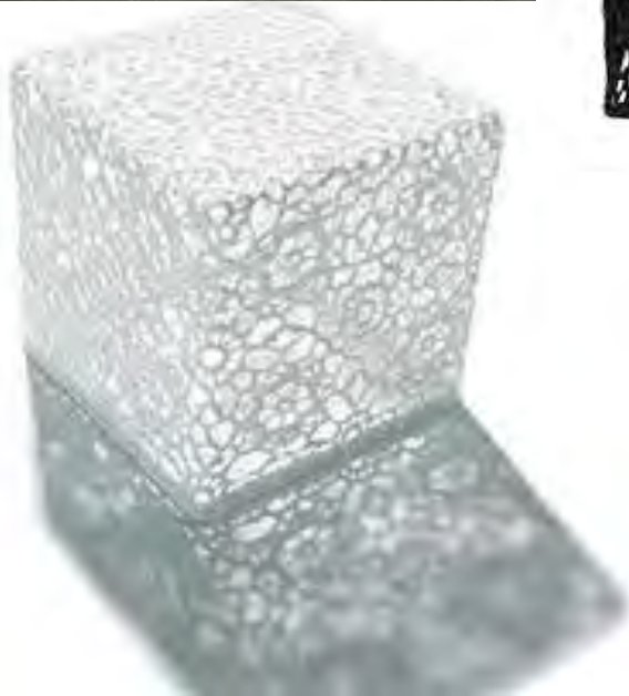
soundscape: white noise