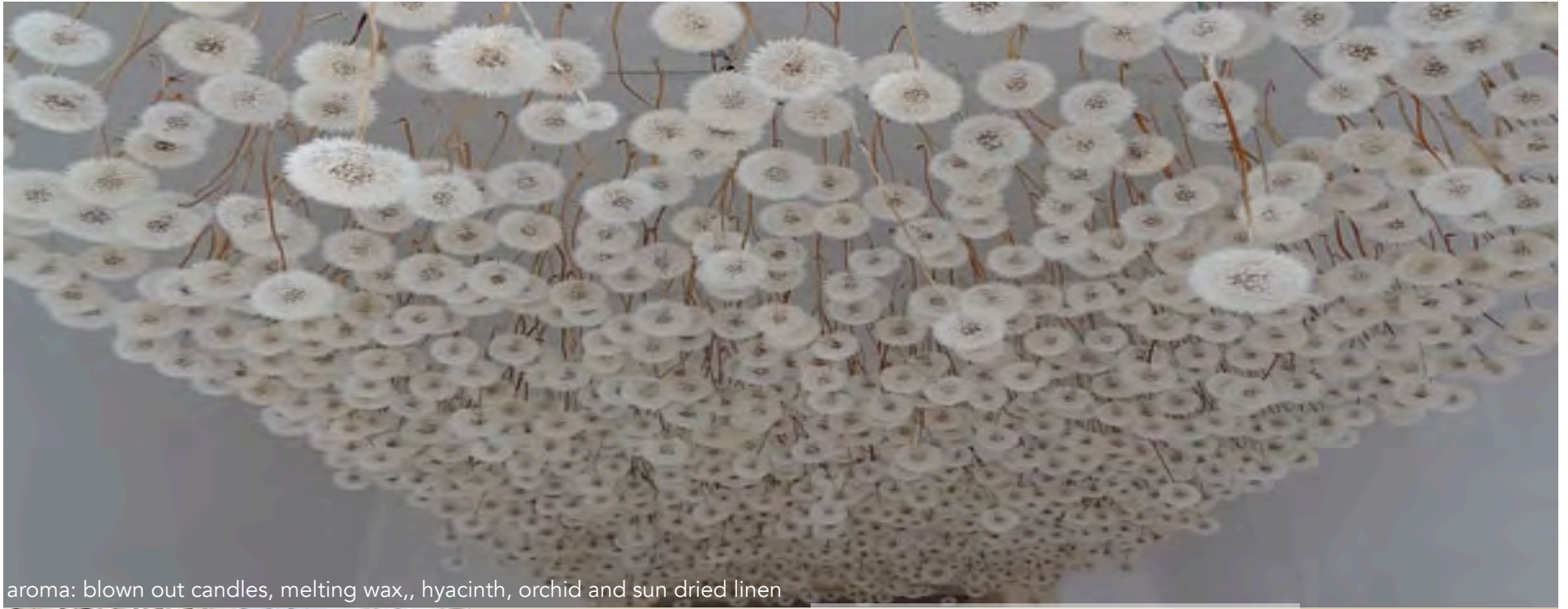
aroma: blown out candles, melting wax,, hyacinth, orchid and sun dried linen